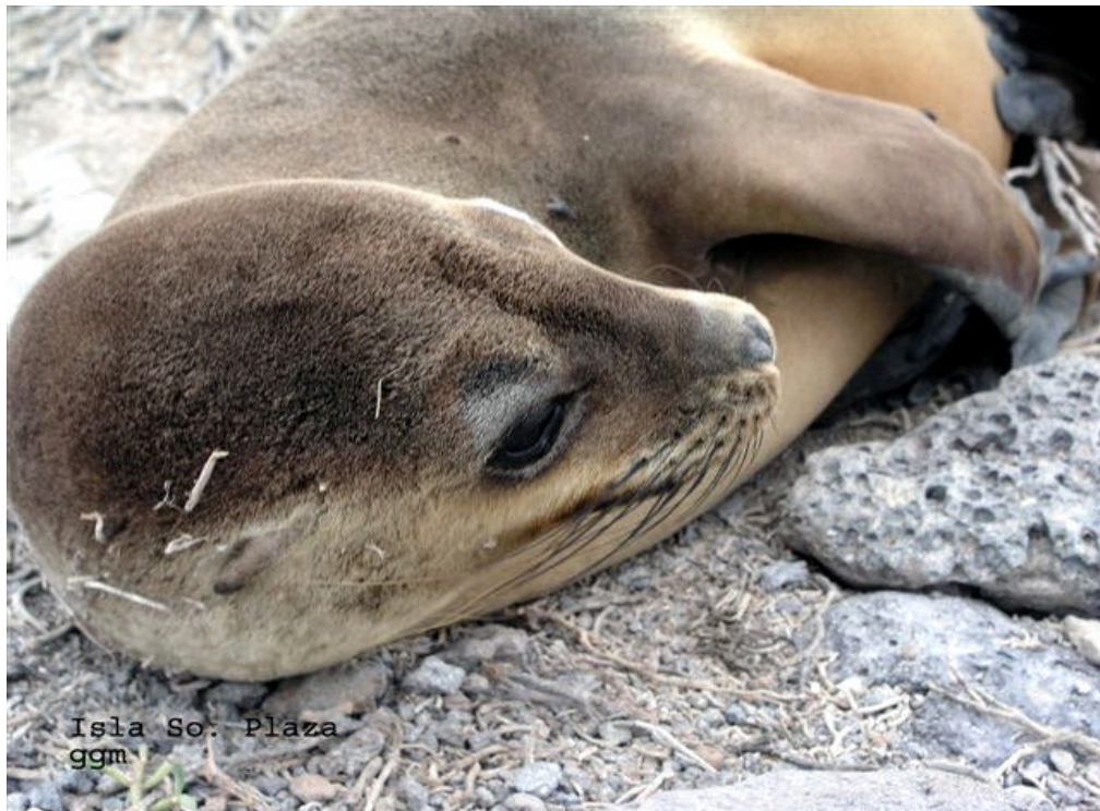
Isla So: Plaza ggm