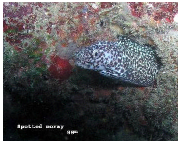
Spotted moray ggm

CENTRAL FLORIDA PLEASURE DIVERS, INC. A NON-PROFIT CLUB FOUNDED IN 1977 P.O. BOX 536891, ORLANDO, FL 32853