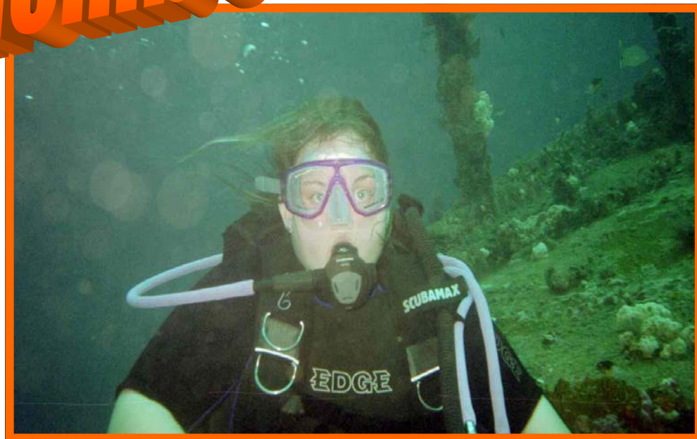
October 2006 Pampano Beach

Here is a small portion of our new Myspace page, check it out!