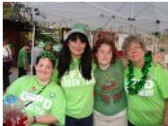
The Rum Punch Queens