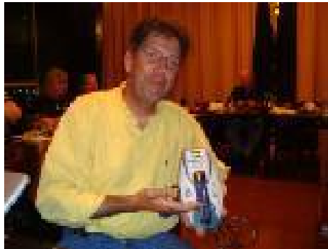
Kerry 2nd Place Fish ID