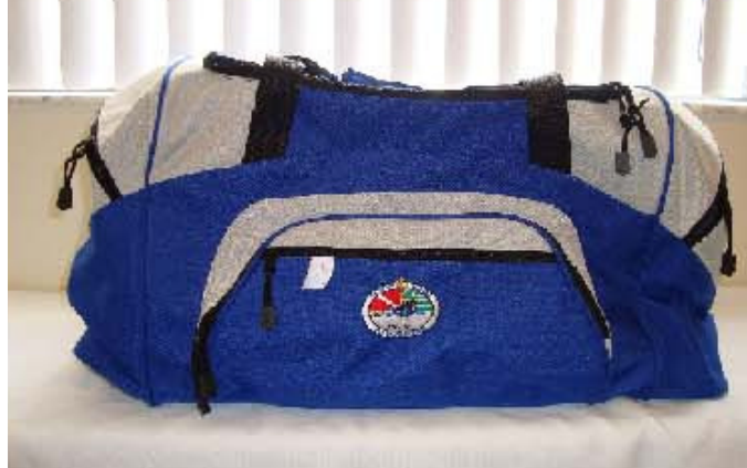
Duffel Bag $30.00