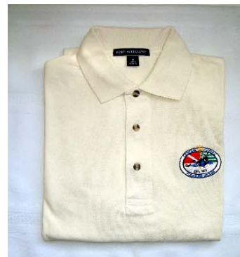
Men's Polo $25.00