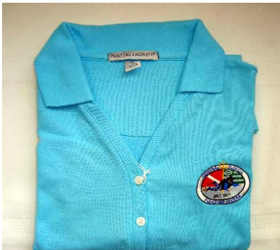
Lady's Polo $25.00